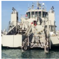
TBV Marine Systems / Launch and Recovery systems (LARS)