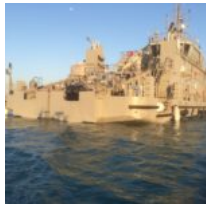
TBV Marine Systems / Launch and Recovery systems (LARS)