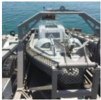
TBV Marine Systems / Launch and Recovery systems (LARS)

This project has again proven TBV Marine Systems' ability to use their experience in developing technical solutions for the global maritime market to effectively tailor the LARS to the specific demands of the customer. By means of a creative team of engineers and their group of partners, the project for the Kuwait Coast Guard has successfully been commissioned with satisfaction from the shipyard and the final customer.