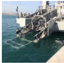
TBV Marine Systems / Launch and Recovery systems (LARS)